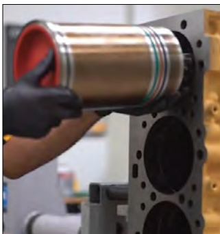
Con Rod Kits

Reduce your machines' down time by using CTP CON ROD Kits